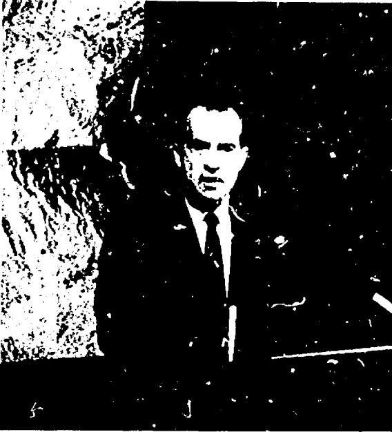
President Nixon addressing the United Nations General Assembly