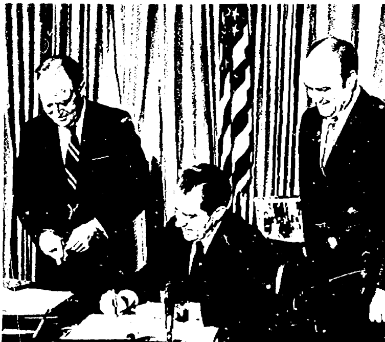
President Nixon signs the Instrument of Ratification for the Nuclear Nonproliferation Treaty. Looking on are Secretary of State William P. Rogers (left) and Secretary of Defense Melvin Laird.

In its report on the treaty, the Foreign Relations Committee stated that it thought the U.S. Government, by offering the resolution and the declaration, had given up an element of flexibility in bringing cases of aggression or threats of aggression to the attention of the Security Council, especially with respect to timing. The Committee observed, however, that if this action results in creating a framework for United States-Soviet cooperation in the United Nations, the "gesture will be worth the costs in diplomatic flexibility."